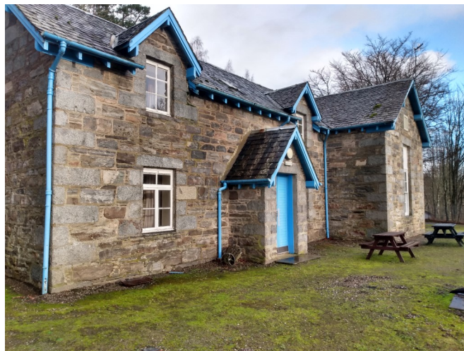
The Outdoor Centre—a new community hub?

Although it is likely that we will be able to apply for grants to fund some of the costs of acquiring the Outdoor Centre and converting it into a community and social space, the hub will need to be self-financing and pay for itself. This means we will need to find ways of generating income to pay for the running and upkeep of the building. As it is an outdoor centre and is