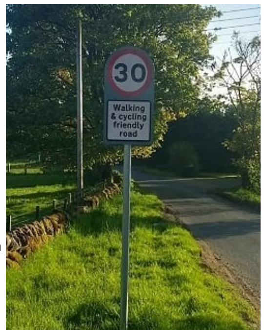
Green route between Glenfarg & Milnathort

With its abundance of forestry trails and land-rover tracks does Rannoch have something to offer the off-road cyclist and mountain biker?