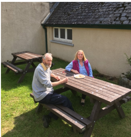
Picnic bench at Kinloch Rannoch Village Hall

In the late spring the group planted hawthorn and other native trees in several locations. On one day they were joined by a group of 22 French Scouts who worked on a couple of Loch side sites alongside members of the Loch Rannoch Conservation Association. Again the work was about litter clearance and cutting back overgrown vegetation.