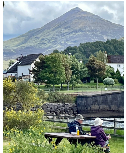
Picnic table on the new Riverside Path