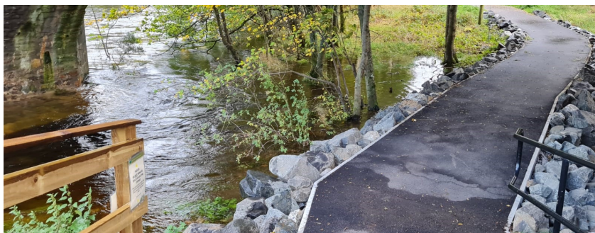
Flood free path beneath the bridge

Although several people were unhappy about the prospect of a wide